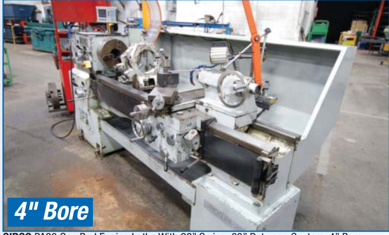
SIRCO PA20 Gap Bed Engine Lathe With 22" Swing, 68" Between Centers, 4" Bore, 1,500 RPM DRO