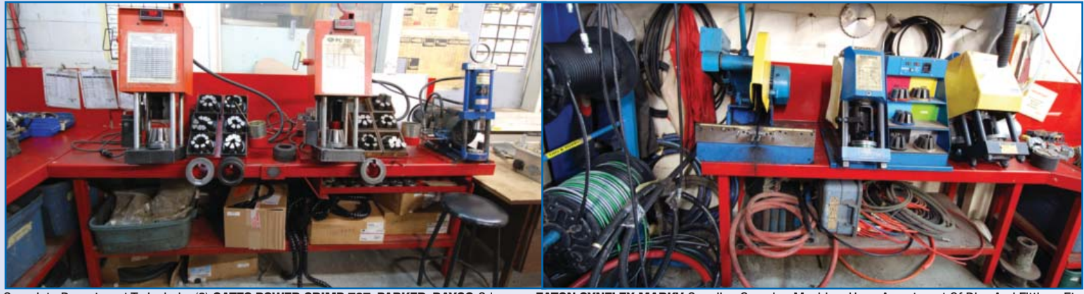
Complete Department To Include: (2) GATES POWER CRIMP 707, PARKER, DAYCO Crimpers, EATON SYNFLEX MARKV Coupling Swaging Machine, Huge Assortment Of Dies And Fittings Etc