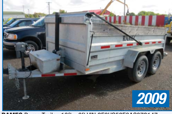
RAMEC Dump Trailer, 16ft x 6ft VIN 2E9US52E9AC072147