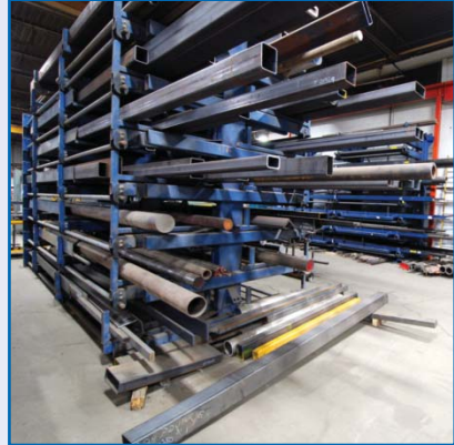
HARDY Material Roll Out Racks