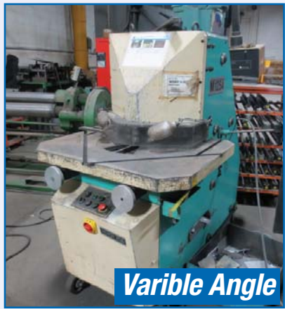
AMADA VERSA 206 Hydrolic Notcher With 1/4" Sheet Thickness, 8"x8" Knife