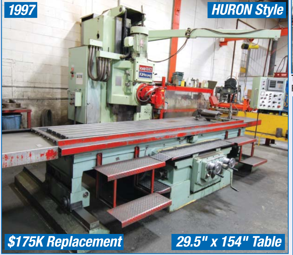
1997 KIHEUG KMB-U-H7 Universal Mill With HEIDENHAIN DRO, 29.5" x 154" Table, Travels: X-126", Y-39.37", Z-31.5", 8800Lbs Table load, Ball Screw XYZ, Weighs 33,000 Lbs, 50 Taper, Vertical Head, 18-1,300 RPM, 15HP, 220V 3 Phase s/n 7090501