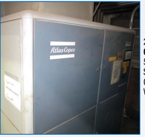
2001 ATLAS COPCO GA37, 50HP Rotary Screw Air Compressor With 16,350 Hrs.,