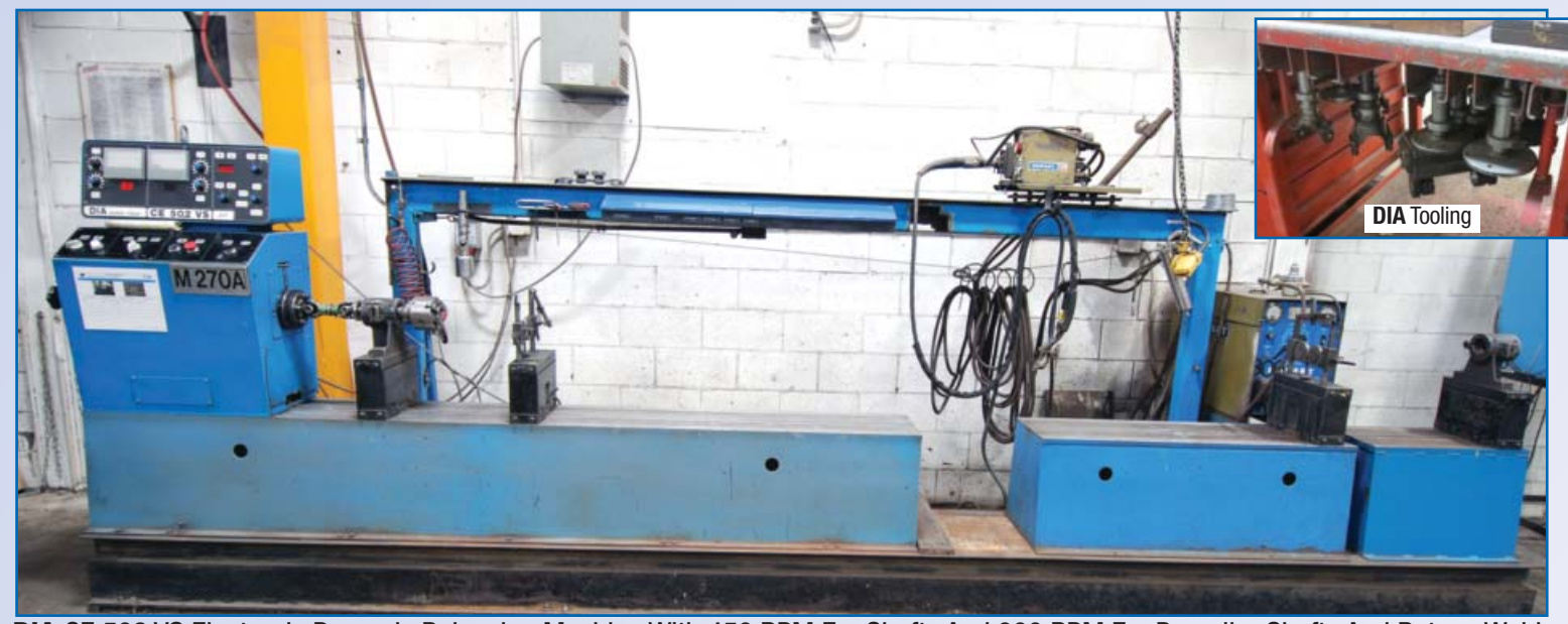
DIA CE 502 VS Electronic Dynamic Balancing Machine With 450 RPM For Shafts And 900 RPM For Propeller Shafts And Rotors, Weld Unit, Large Qty Of Attachments And Tooling s/n 10182