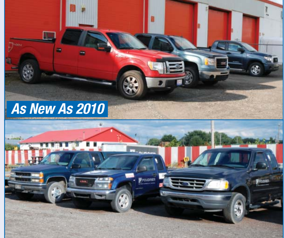
Partial View Of Pickup Trucks