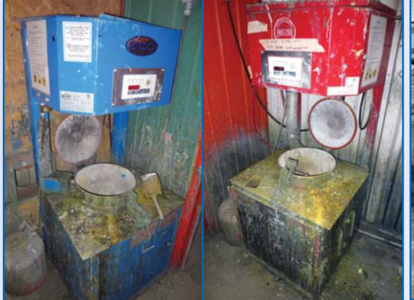
(2) ECO SR30V & PRO TEK Solvent Recyclers s/n 0251