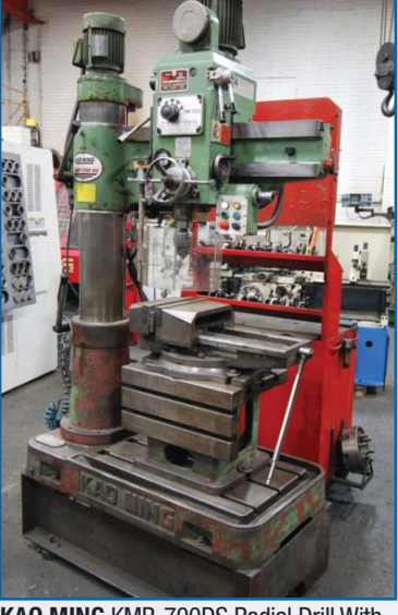
KAO MING KMR-700DS Radial Drill With 1,500 RPM, Box Table

PROMECAM 25 ton horizontal VERSAPRESS with 17" stroke, 31.5" x 23.5" work area