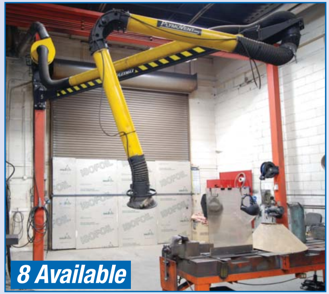
PLYMOVENT Welding Exhaust Units With Flexmax 12ft Arms And Blower, 50kg Cap., Self-Contained Units