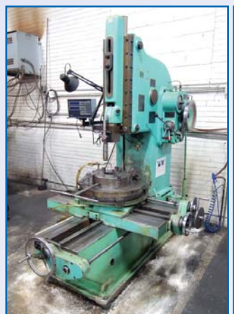
CHEN Slotter With 25" Dia. Rotary Table s/n 82058