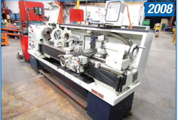
BENIGN Gap Bed Engine Lathe With 24" Swing, 86" Between Centers, 12" Chuck, 2,000 RPM, DRO, 3" Bore, s/n 0267 s/n 071