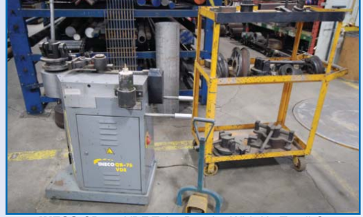
2001 INECO QB-76 VDE Tube Bender With Up To 3" Cap., With Dies s/n 76C330