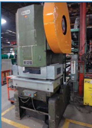
BAUTOR 110 Ton OBI Press, Air Clutch