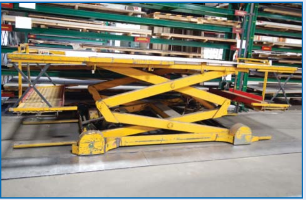
Motorized Track Mount Scissor Lift With 11ft 4" X 72" Lift Area