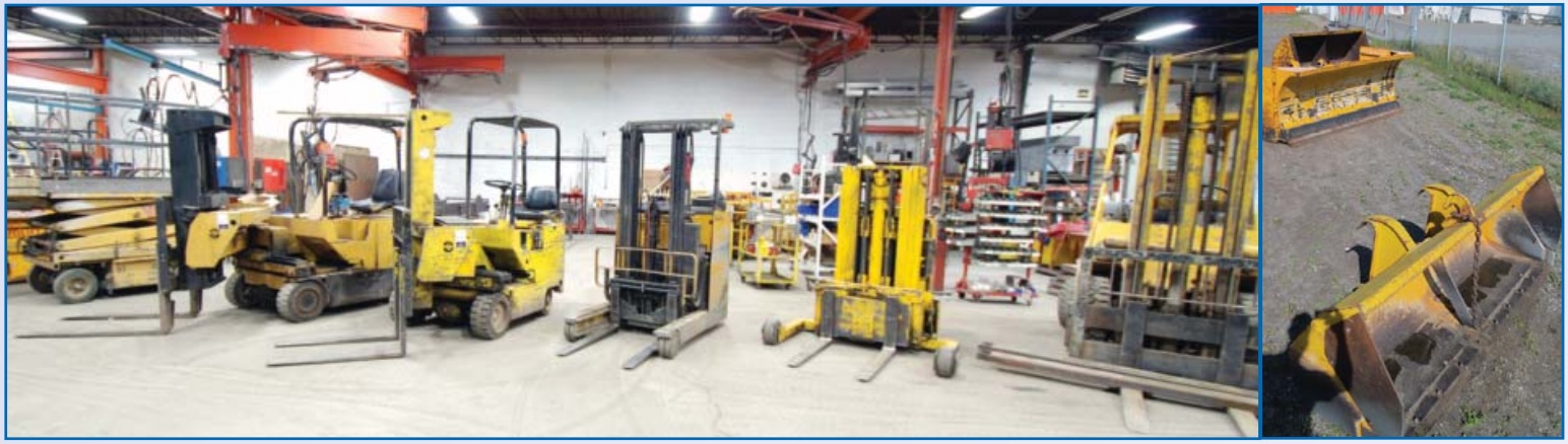
DREXEL SL43FSS 4000 Lbs. Cap. Swing Mast Forklift s/n 025 DREXEL SL66 7,000 Lbs. Swing Mast Forklift