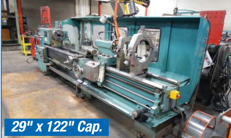
TOS SN71C/3000 Gap Bed Engine Lathe With 29" Swing, 122" Between Centers, 12" Chuck, 1,000 RPM, 3" Bore, DRO, 2 Steady Rests