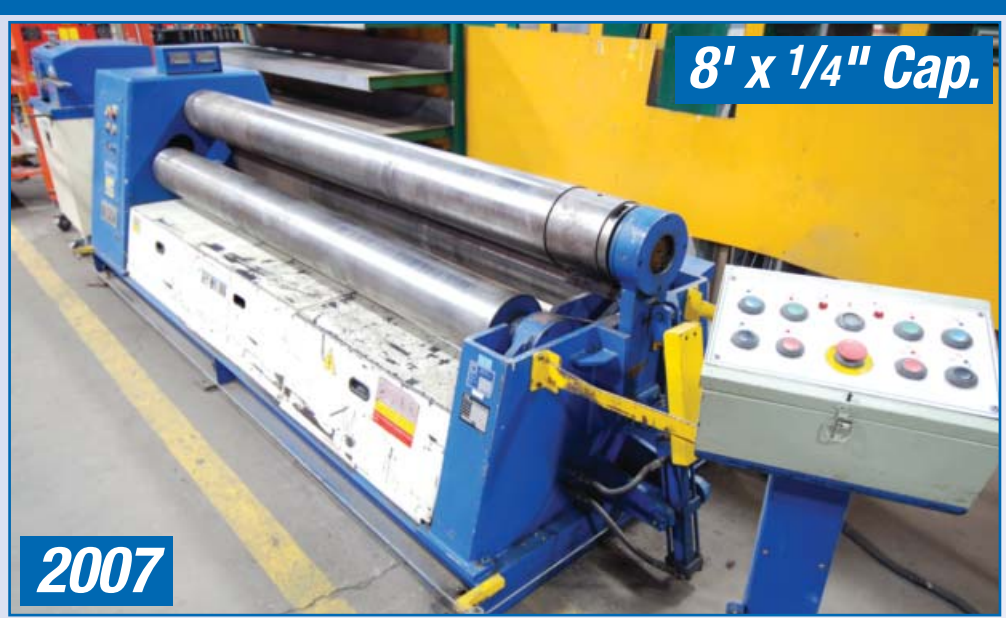
D-BUR-R M 130A