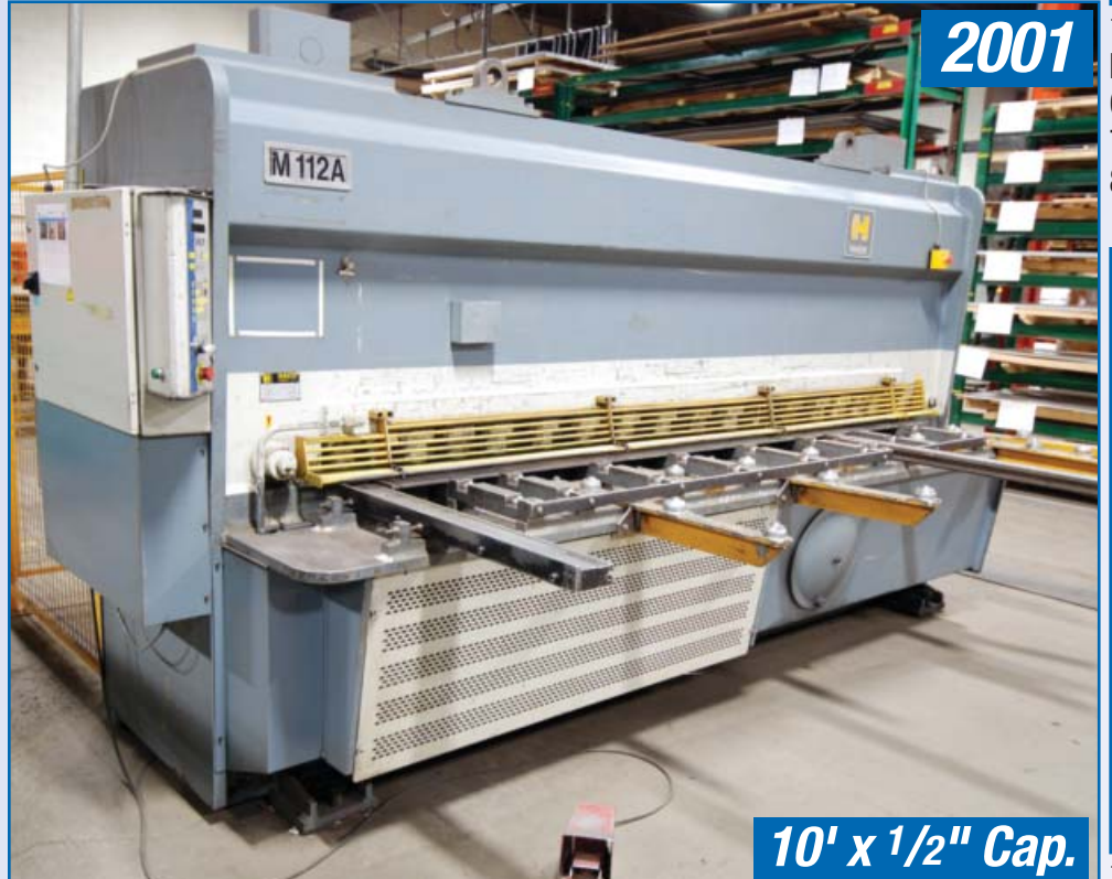
2001 HACO HSLX 3013, Hydraulic Shear With 10ft X 1/2" Cap., SC7 Front Operated Power Back Gauge, 39 1/4" Squaring Arm, Roller Supports, 575V s/n 69501