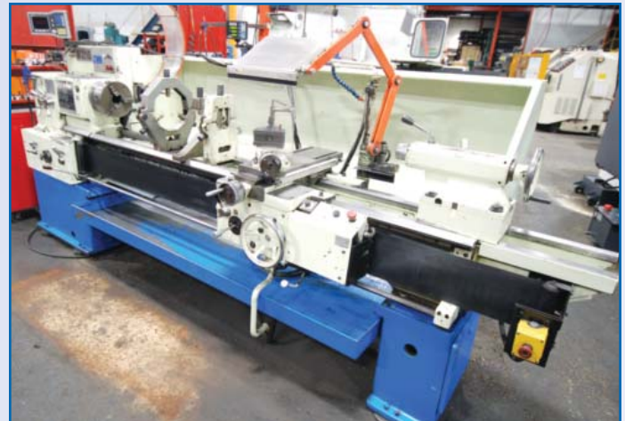
TOS SN 50 Gap Bed Engine Lathe With 21" Swing, 98" Between Centers, 16" Chuck, 2" Bore, DRO, 2,000 rpm, Steady Rests