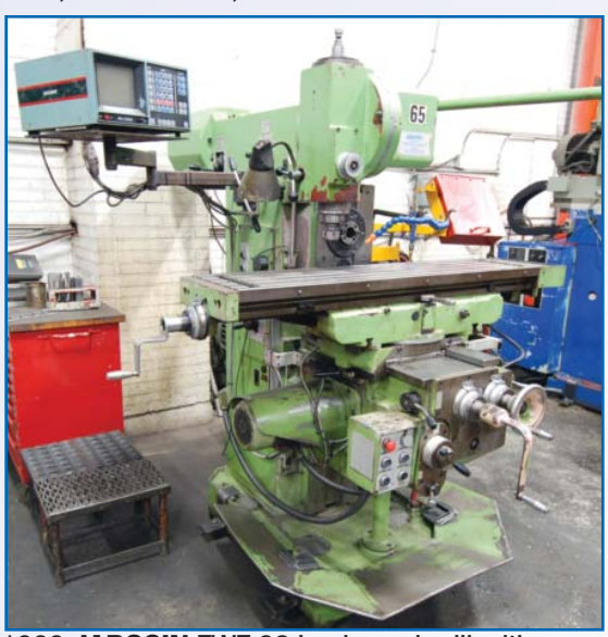
1989 JAROCIN FWF 32J universal mill with 12.5" x 51" table, ACU-RITE MILLVISION readout s/n 0119