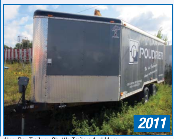
Also: Box Trailers, Shuttle Trailers And More