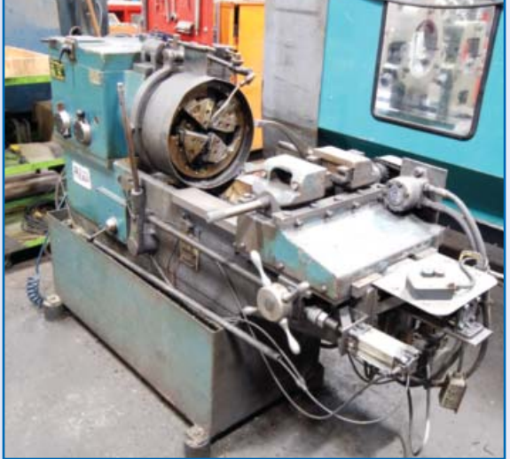
JOSHUA HEAP Power Threader With Up To 3" Capacity s/n 965T TOS BPH 300 12" x 39.5" Surface Grinder, s/n 0211138

PROMECAM 25 ton horizontal VERSAPRESS with 17" stroke, 31.5" x 23.5" work area