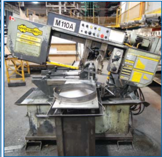
1991 HYDMECH S-20A Automatic Horizontal Bandsaw With 13" X 18" Capacity, 1-1/4" Blade, 5 HP Blade Drive Motor, 75-400 FPM, Clamping, s/n 10991558