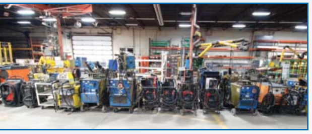
View of 50+ MILLER, ESAB, CANOX, HOBART, MEMCO Welders