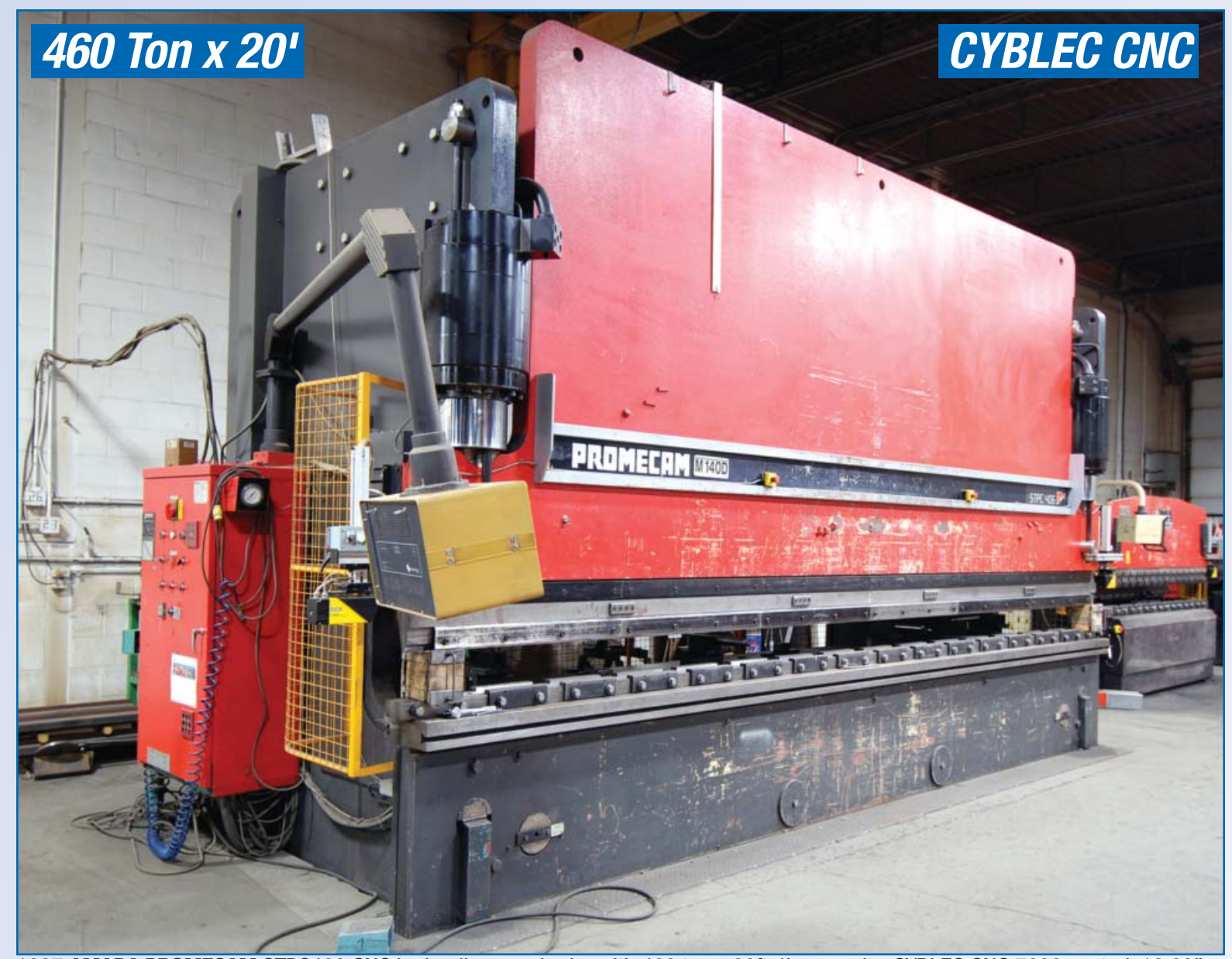
1987 AMADA PROMECAM STPC406 CNC hydraulic press brake with 460 ton x 20ft 4in capacity, CYBLEC CNC 7000 control, 12.60" stroke, 18ft 4" between housings, 25" throat (upgrade), 071 MS stopping time, SICK V4000 laser curtains s/n 60-0103