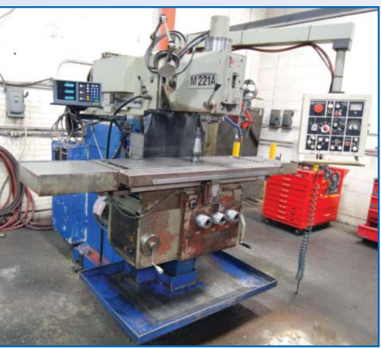
TOS Vertical Mill With 15.75" X 55" Table, 1,800 RPM, Power Feeds, With DRO