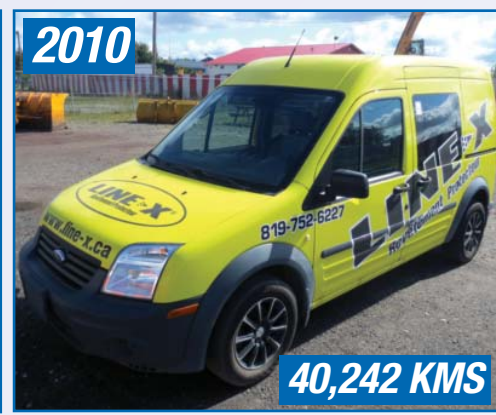
2010 FORD Van/Truck, VIN NMOLS6ANAZAT033924